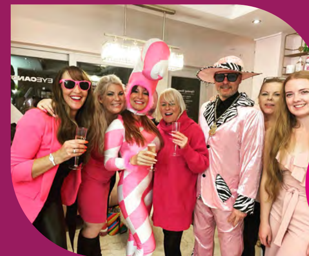
Supporters at Eye Candy Go Pink for Ashgate Hospice

"Having nowhere else to be except by my husband's side meant the world to both of us."