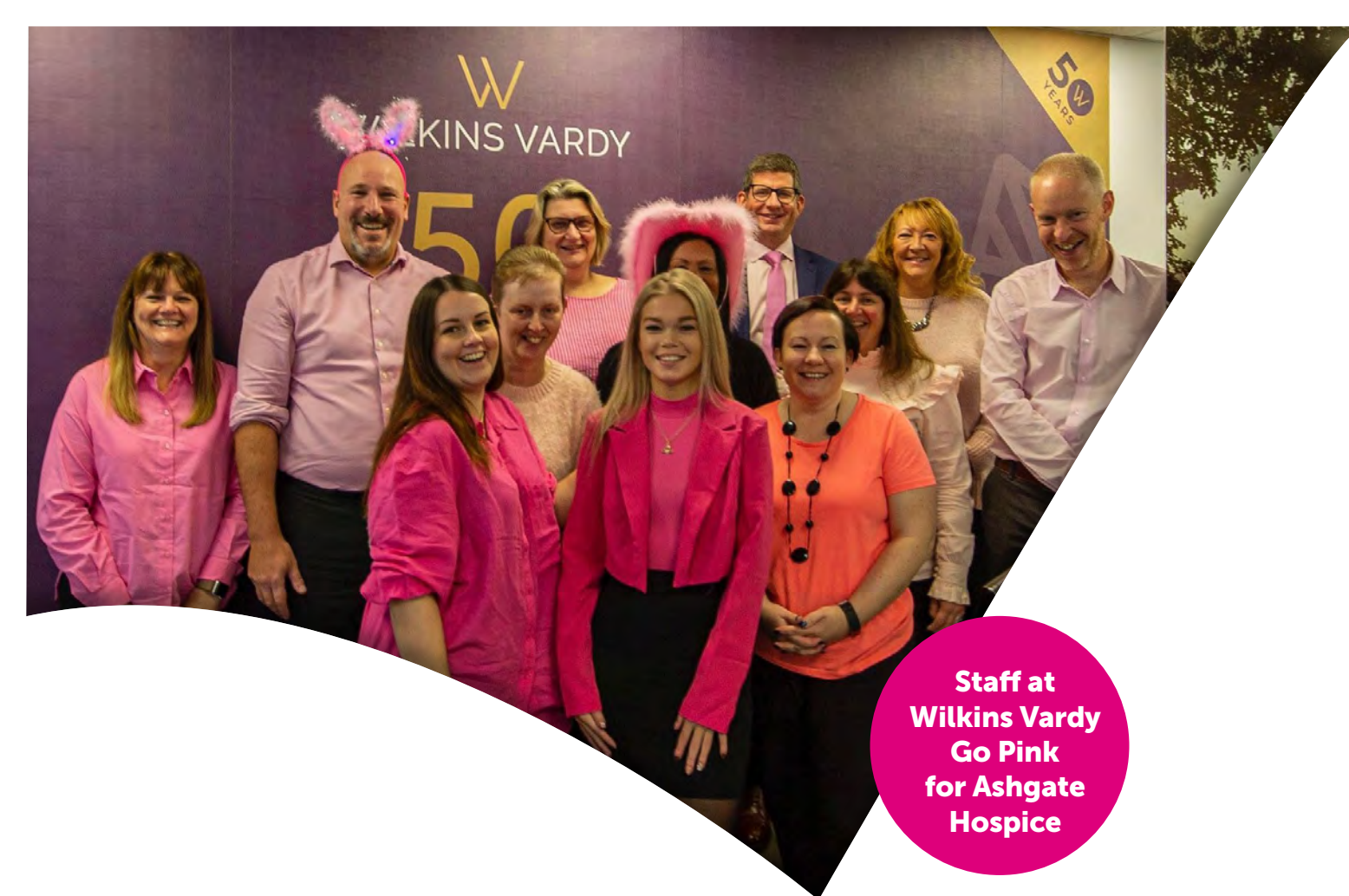
Staff at Wilkins Vardy Go Pink for Ashgate Hospice

Your dedicated Partnership Manager will provide everything you need to make our partnership a success. We will be with you every step of the way to ensure everything goes as smoothly as possible.