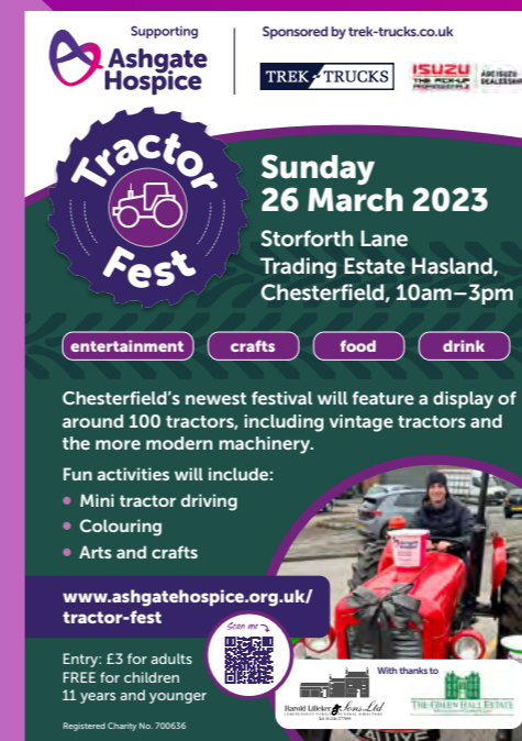
Example of logo placement on 2023's event poster

Example of a pedal tractor with your company branding