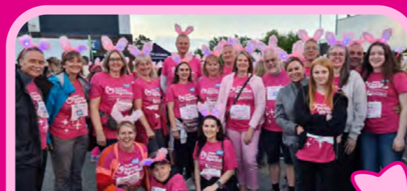
Team DSF Workplace Winners

If you aren't already in a team but would like to create one please email events@ashgatehospice.org.uk