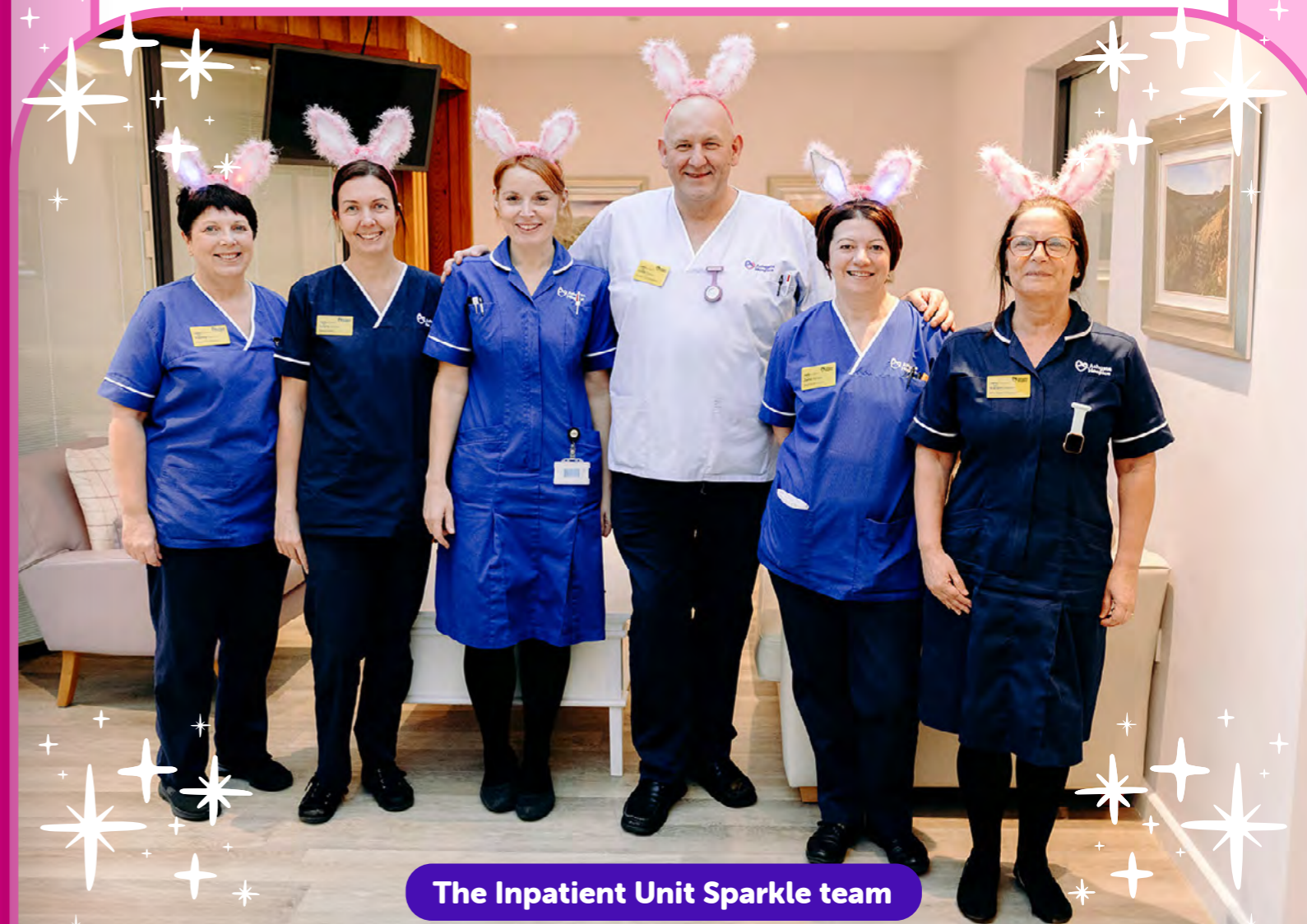
The Inpatient Unit Sparkle team

“Joining the Sparkle Night Walk isn’t just a stroll; it’s a glowing adventure with your favourite people. Team up for laughs, sparkle in unity, and let the good times roll – because when the going gets tough, the tough grab glitter and strut their stuff. It’s not just a walk; it’s a shimmering soirée with your crew. Get ready to sparkle, giggle, and conquer the night together – Just like the Ashgate Hospice Inpatient Unit team!”